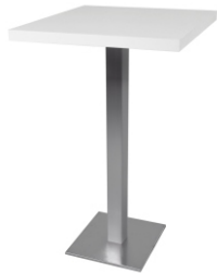
Art. 29120/29125 High table stainless steel w or b 53,00 €