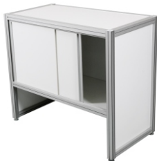
Art. 42295 Counter 62,10 €