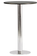
Art. 29080/29090 High table chrome/wh or bl 31,00 € / 34,00 €