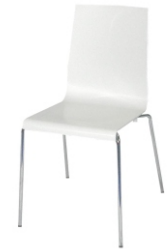
Art. 12680 Chair Kuadra 10,60 €