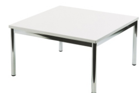
Art. 21081 Coffee table chrome/white 21,10 €