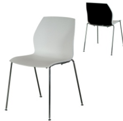
Art. 12112/12113 Chair Kalea wh/bl or wh/red 18,40 €