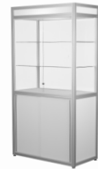
Art. 50121a High showcase H 200 lit-up 263,00 €