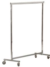
Art. 30001 Wardrobe rack chrome 24,00 €