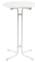
Art. 29010 High table white, foldable 19,30 €