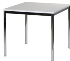
Art. 21001/21002 Meeting table white or black 80x80 21,00 €