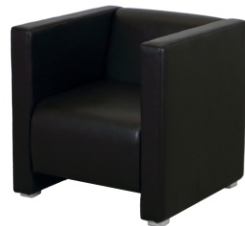
Art. 15015/15016 Armchair Qubo white or black 80,30 €