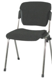
Art. 10261 Chair Flou anthracite 12,00 €