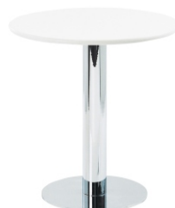
Art. 26000/26010 Bistro table chrome/wh or bl 19,00 € / 20,50 €