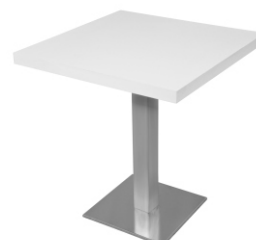
Art. 26120/26125 Bistro table stainless steel wh/bl 44,00 €