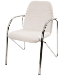
Art. 15604 Conference armchair 25,00 €