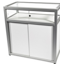
Art. 50111 Table glass cabinet 150,00 €