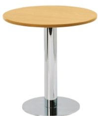
Art. 22104 Bistro table chrome/beech 25,00 €