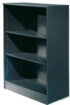
Art. 50206/50207 Filing shelf wh or bl, H 110 28,00 €