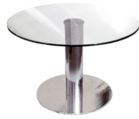
Art. 27050 Coffee table chrome/glass 48,00 €