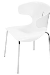
Art. 12070 Chair Vanilla 32,20 €