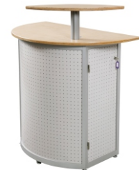
Art. 50631 Computer high desk 138,00 €