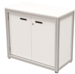
Art. 50020/50018 Sideboard white or black 62,10 €