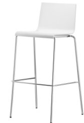
Art. 16680 Bar stool Kuadra white 18,90 €