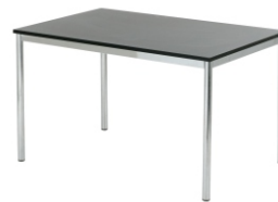
Art. 21021/21022 Meeting table white or black 120x80 23,50 €