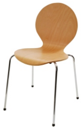
Art. 12030 Chair Balloon beech 11,80 €