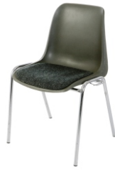
Art. 10130 Shell chair cushioned 7,10 €

Tel. +49 30 684086-0 info@expofair-berlin.de www.expofair-berlin.de