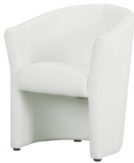
Art. 15000/15100 Club armchair black or white 60,00 € / 61,00 €