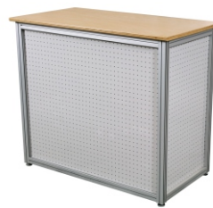
Art. 42451 Counter Magic 116,00 €