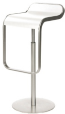
Art. 16022 Bar stool LEM white 54,40 €