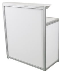
Art. 42305 Counter with composition 75,00 €